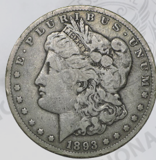
F - Fine Condition