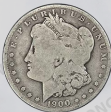
G - Good Condition

Refers to the amount of wear on the detail of a coin