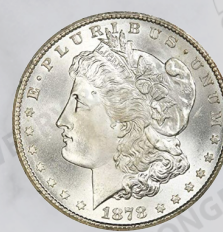
XF - Very Fine Condition

The less wear, the higher the value on specific series